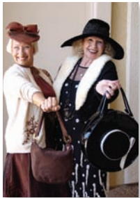
Photo banners show the fun, guests, purses and shoes from 'Black Tie & Tennies' and 'Old Bags' events!