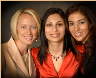
Clients served at our Women's Day of Self-Esteem